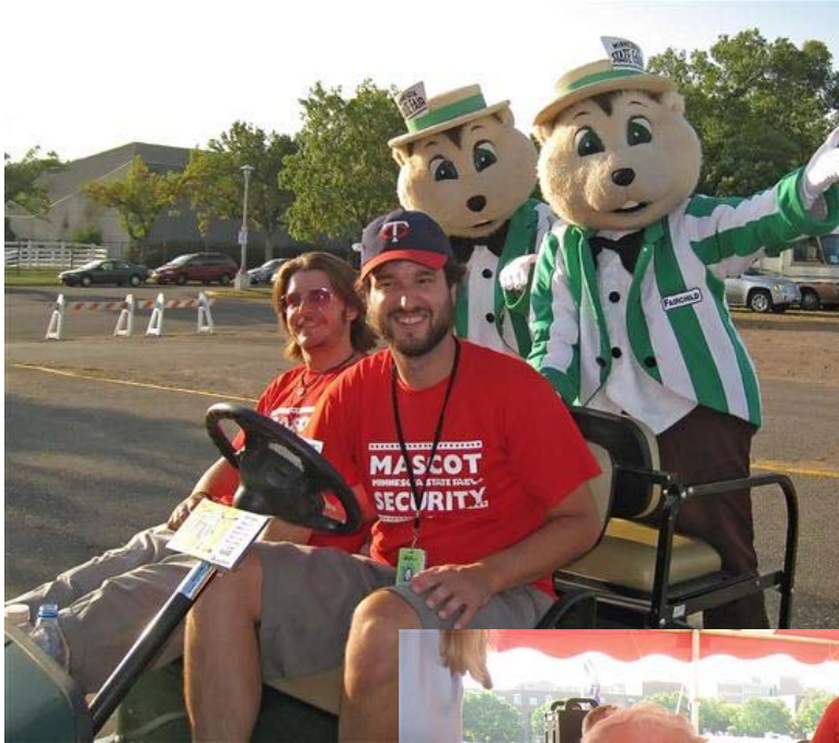
The State Fair mascots with their own security!